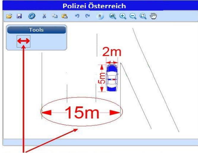
Placement of distances with absolute precision with one click at a scale of 1:1.

Furthermore, the police officer or the accident insurance company employee can easily add a text note (on top of the distance) and even choose the color of this note.